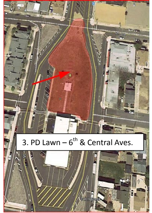
3. PD Lawn – 6 th & Central Aves.