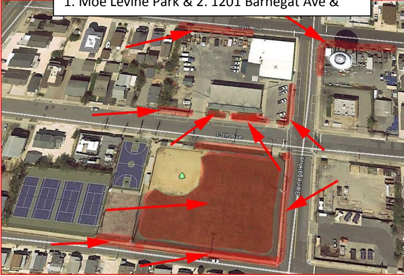
1. Moe Levine Park & 2. 1201 Barnegat Ave &